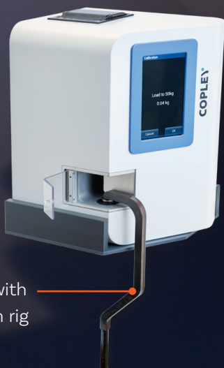
TBF 100i with calibration rig