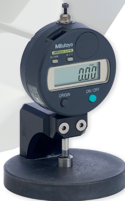
Mitutoyo Measuring Gauge

Alternatively, tablet weight and thickness can be entered into the TBF 100i system manually.