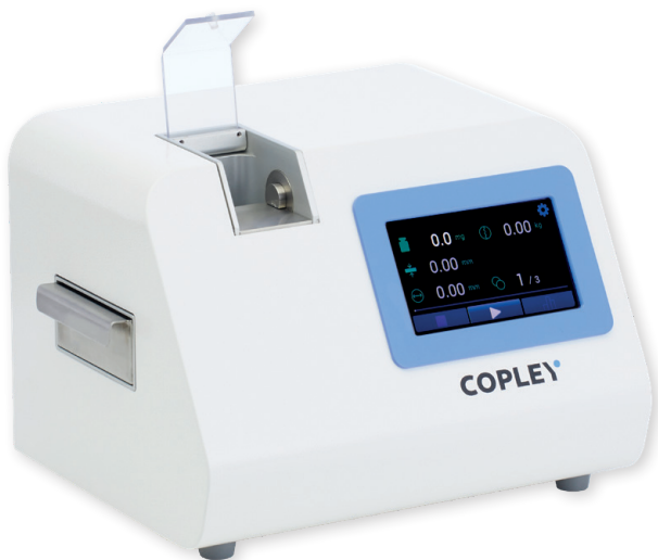
TBF 100i with open guard