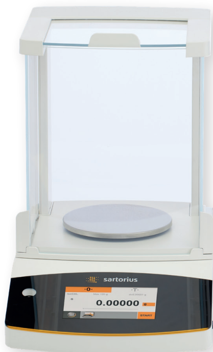
Sartorius Balance Model Quintix 224-1 CEU