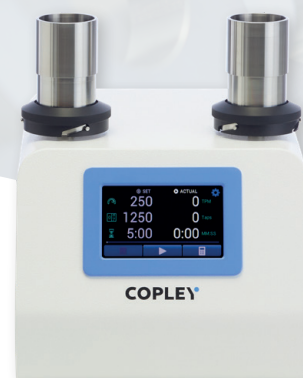
JV 200i with Method 3 platform

Acoustic Cabinet reduces the noise level produced by the JVi series unit